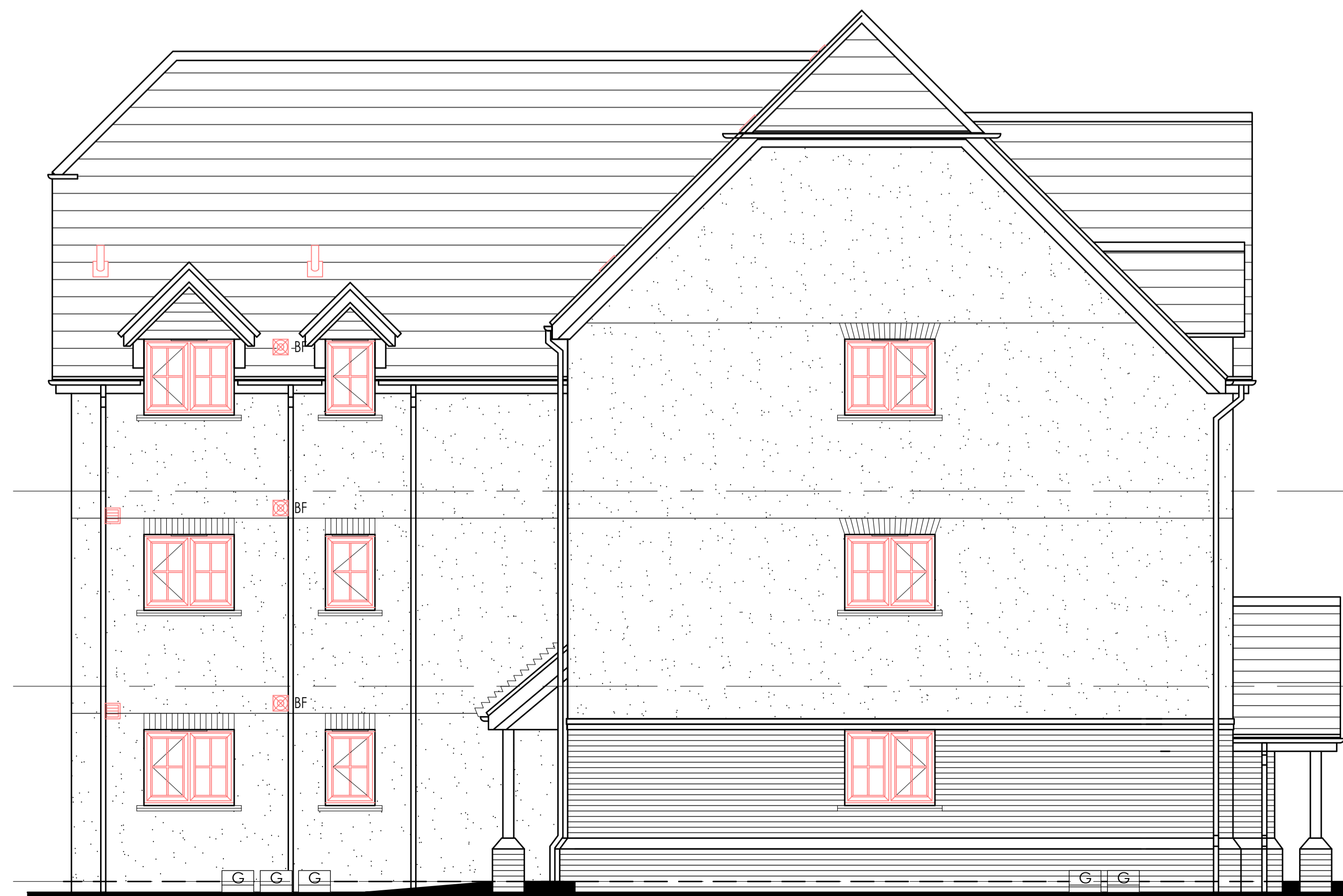
South Elevation Block 1 (East Block 2)