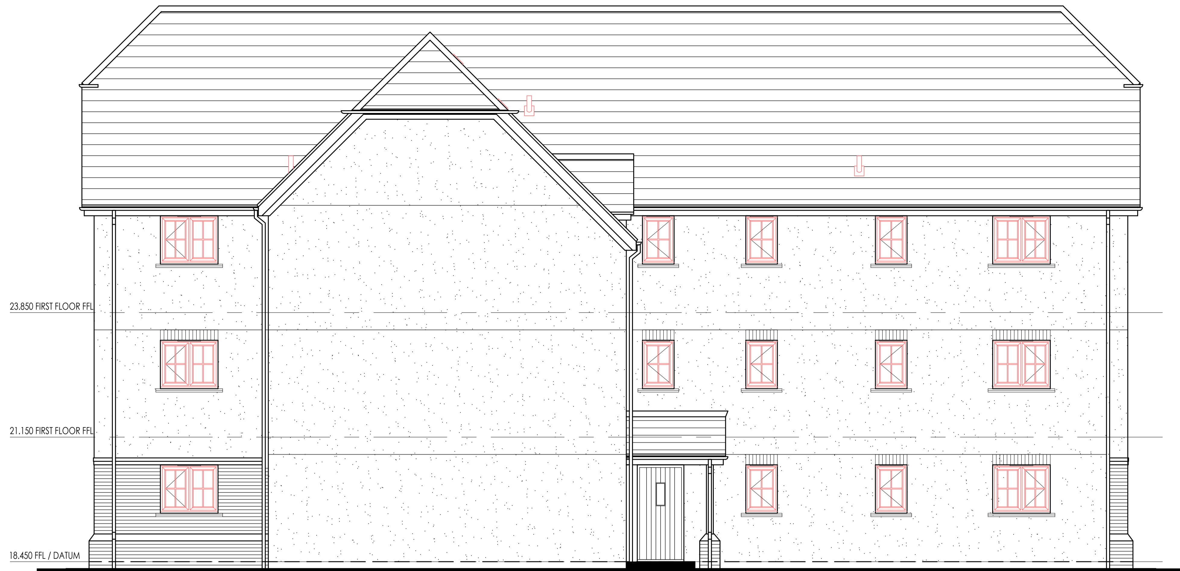
West Elevation Block 1 (South Block 2)