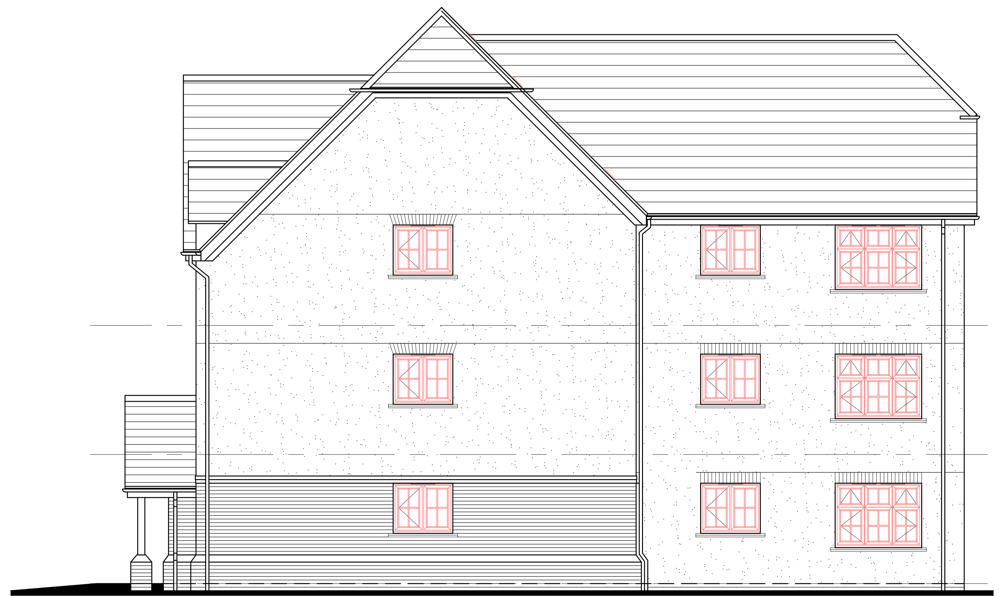
North Elevation Blocks 1 (West Block 2)