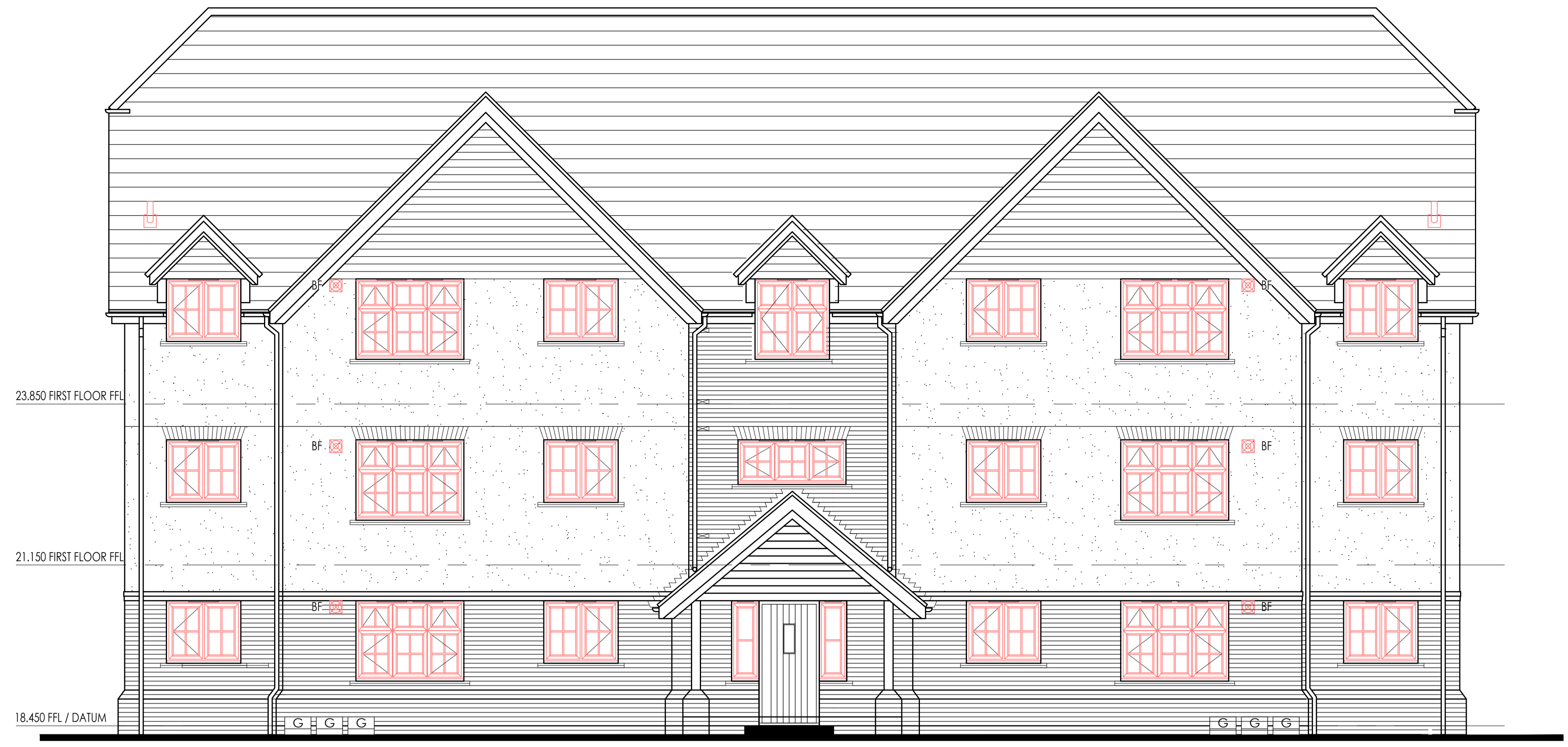
East Elevation - Block 1 (North Block 2)