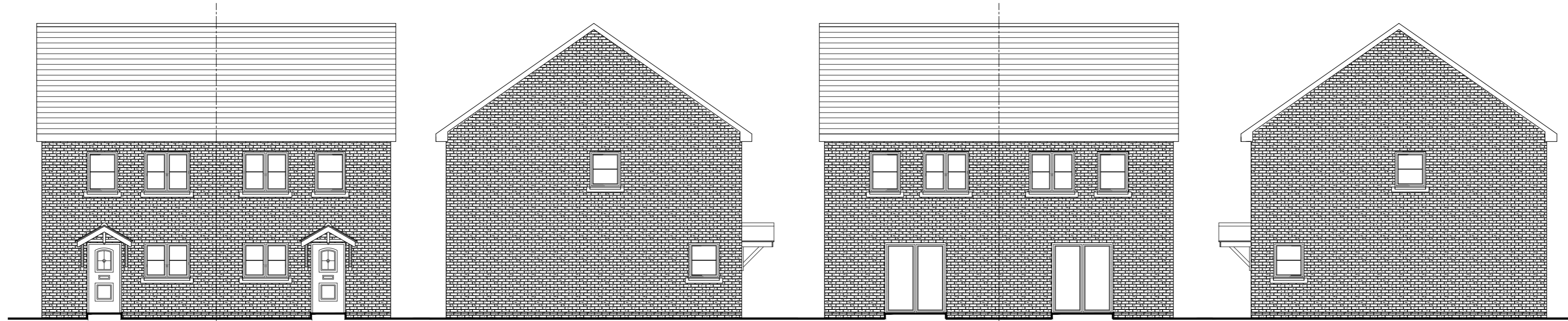
Front Elevation 1:100