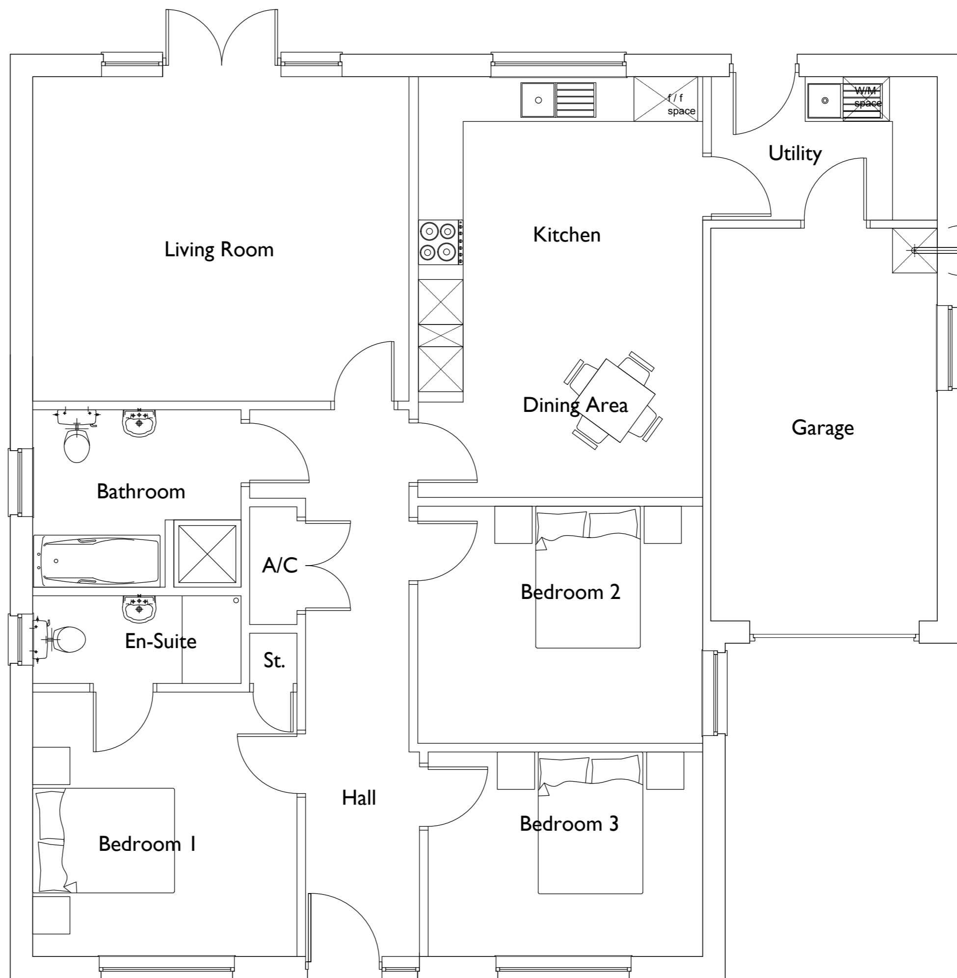
Ground Floor Plan 1:50