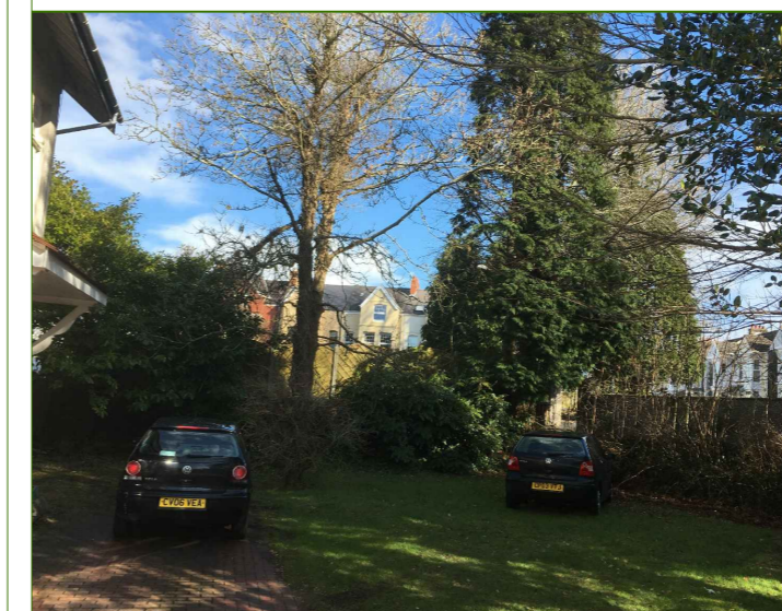
T2 - ASH GROWING NEAR SIDE GARDEN BOUNDARY - TWIN STEM, EARLY DIE-BACK, POOR CROWN SHAPE.