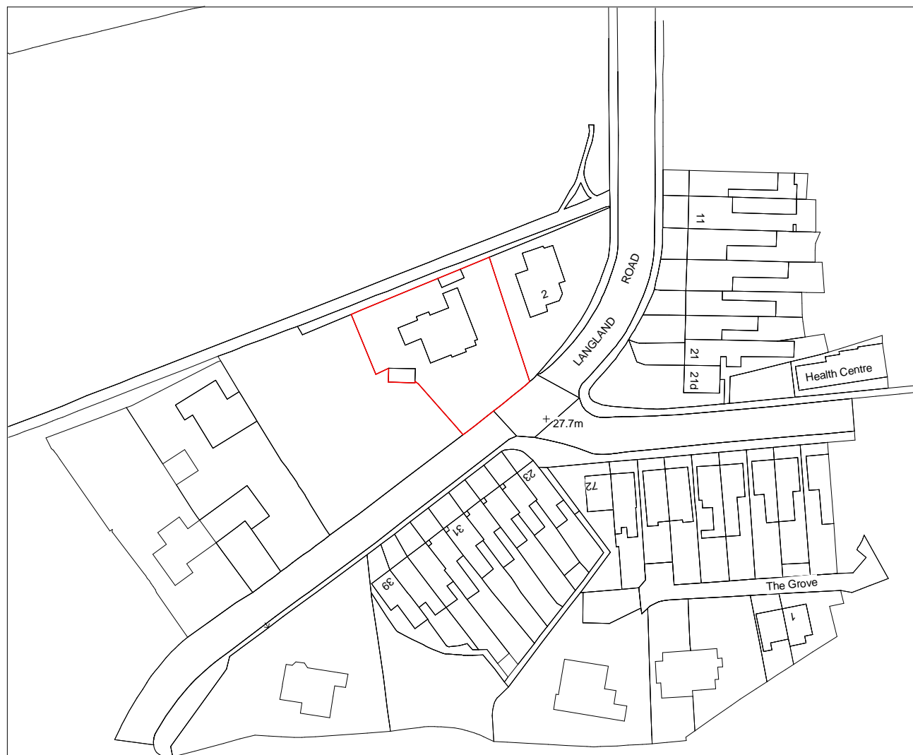
1 Site location plan 1 : 1250