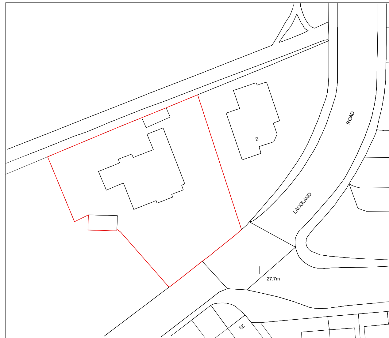
2 Block plan 1 : 500

9 Pine Tree close Burry port Carmarthenshire SA16 0TF