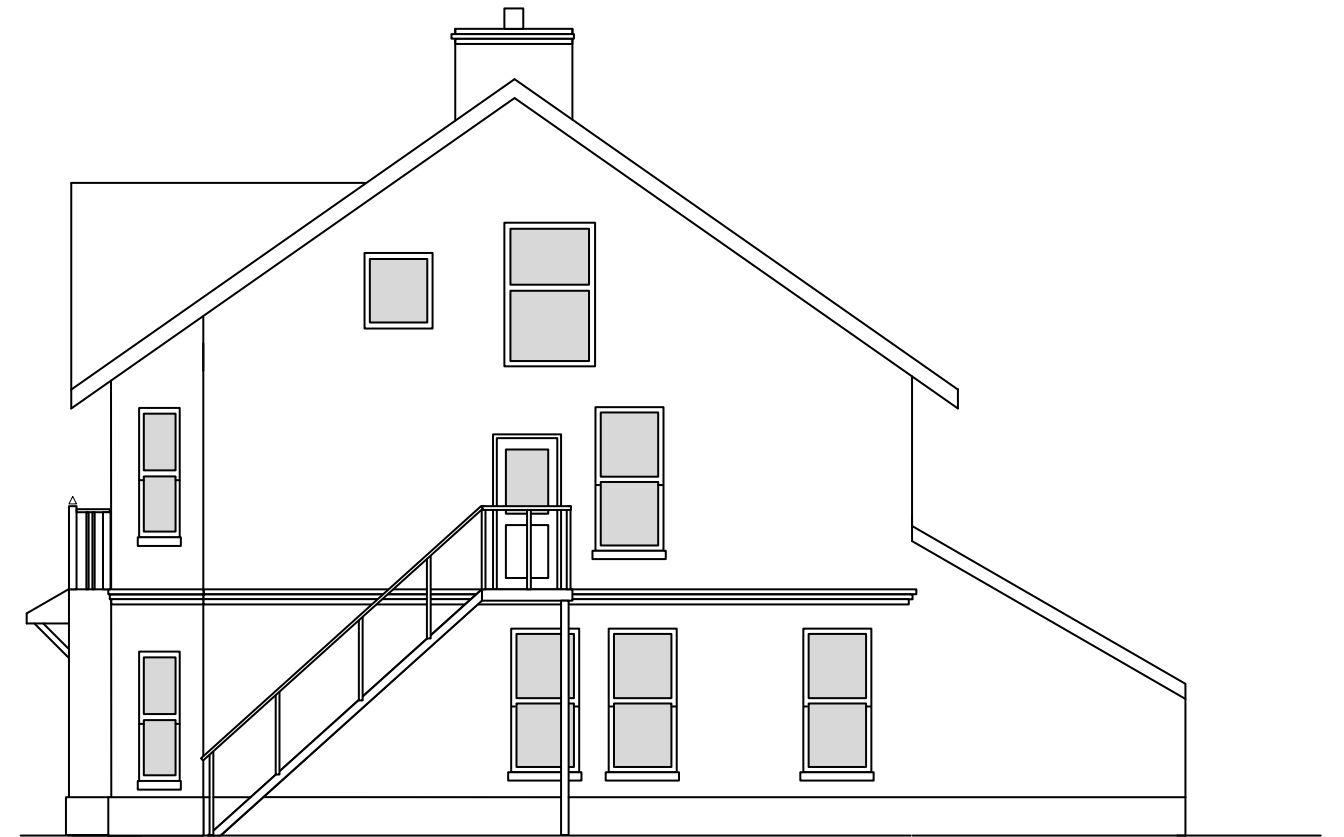
Elevation on B