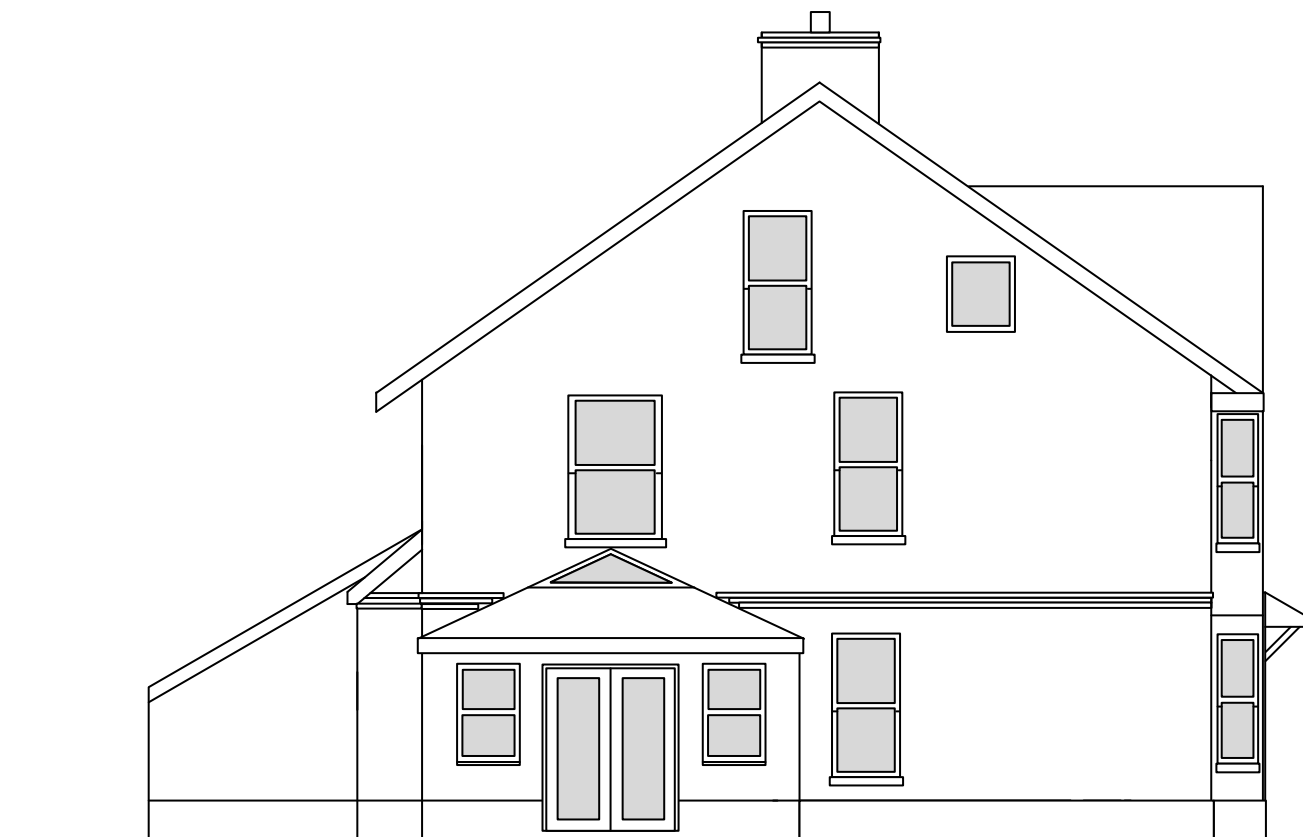
Elevation on A