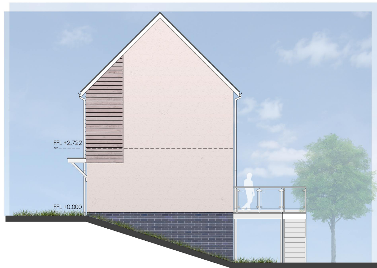
RIGHT SIDE ELEVATION OPTION 1