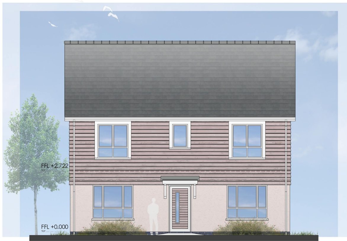
FRONT ELEVATION OPTION 1