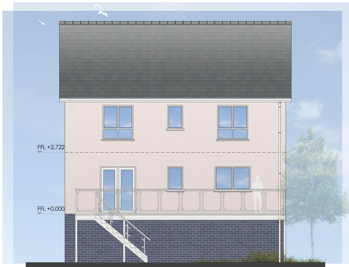
REAR ELEVATION OPTION 1